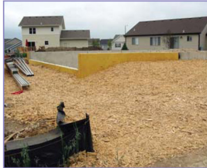
Wood mulch from lumber waste covers bare ground.

◆ Use straw or wood mulch, compost, hydroseeding, or RECPs when temporary seeding is not practical. Mulch can be utilized in any weather at any time.